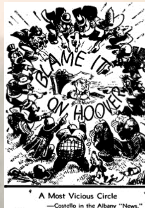
A Most Vicious Circle